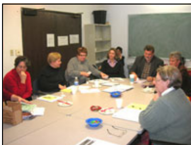
Suicide Prevention Committee